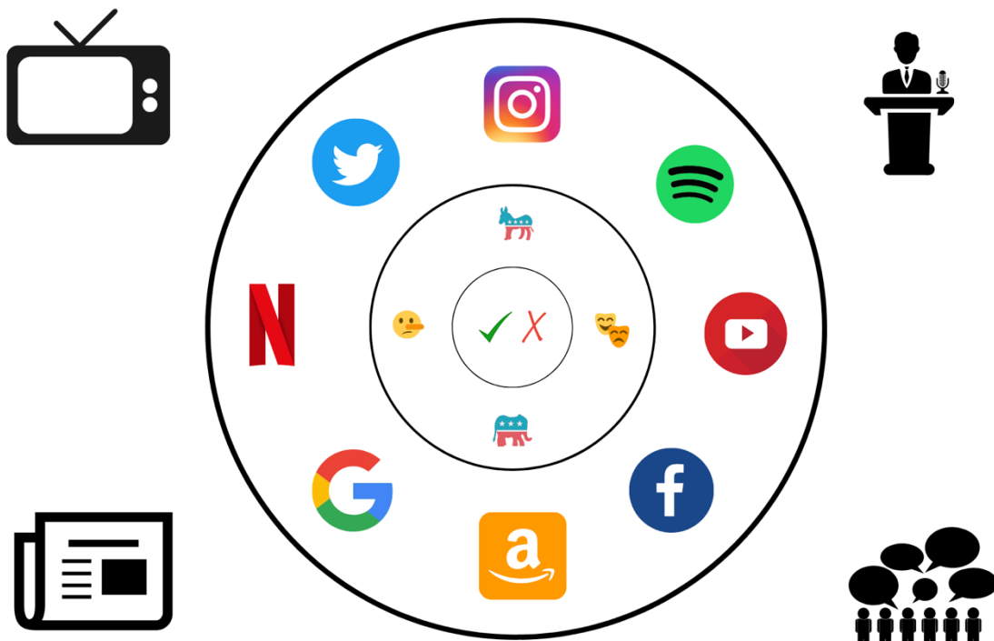
Figure 1. Contextualizing Misinformation Prevalence and Circulation